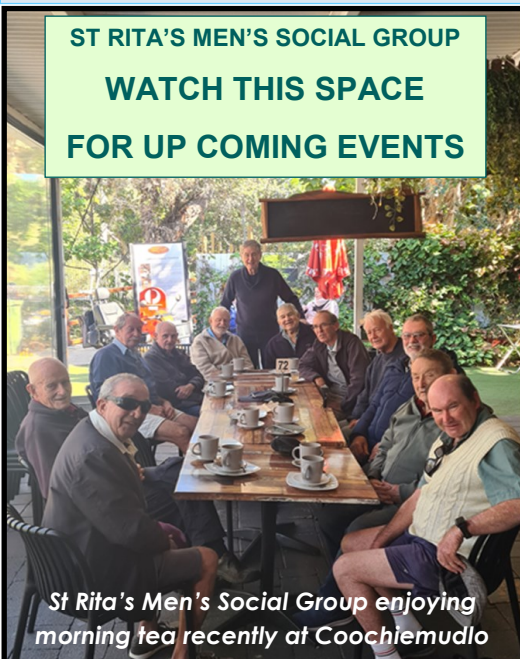
St Rita's Men's Social Group enjoying morning tea recently at Coochiemudlo

ST RITA'S MEN'S SOCIAL GROUP WATCH THIS SPACE FOR UP COMING EVENTS